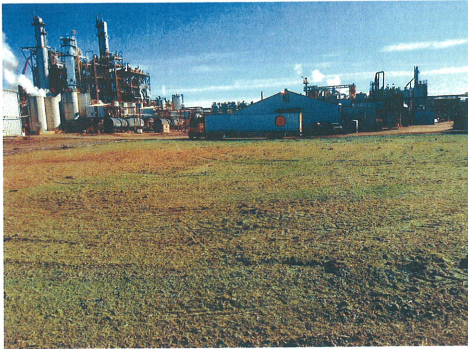
Photo 3. Completed closure.