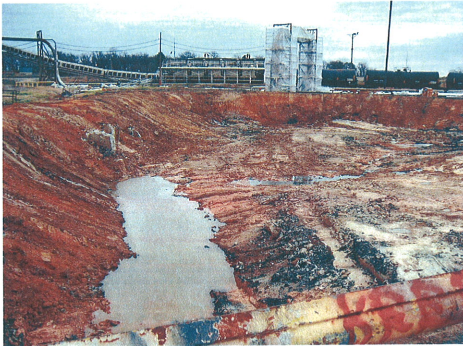
Photo 1. Excavated pond January 8, 2014.